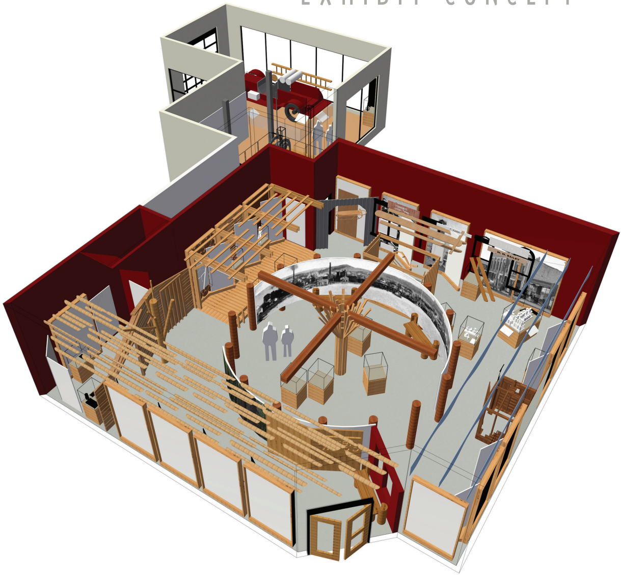
"Boyne Before Us" Exhibits Boyne Heritage Center